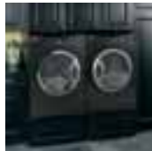
Custom built-in/ custom under counter