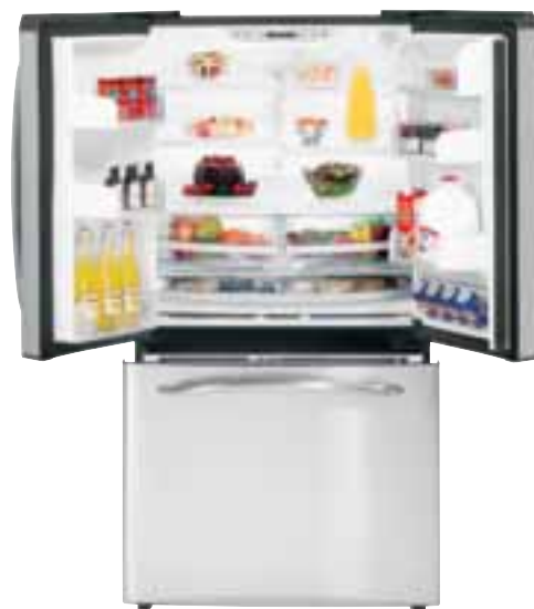
PFSS5NFW GE Profile 25.1 cu. ft. French-door refrigerator with icemaker