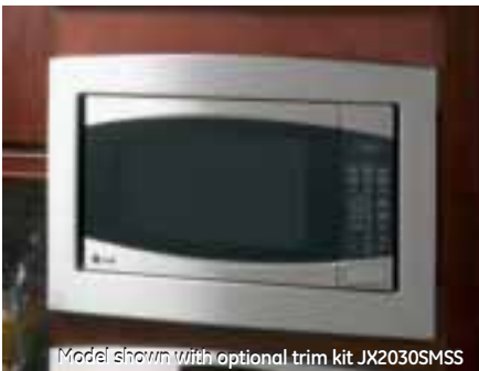
Model shown with optional trim kit JX2030SMSS