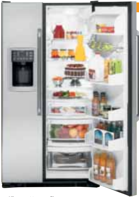
CSS25USW GE Café 25.4 cu. ft. refrigerator