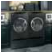
Side-by-side with pedestals

*Washes equivalent amount of clothes as similar cubic foot agitator machine, per IEC ratios.