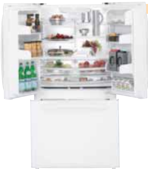
PFCF1NJW GE Profile counter-depth 20.9 cu. ft. French-door refrigerator