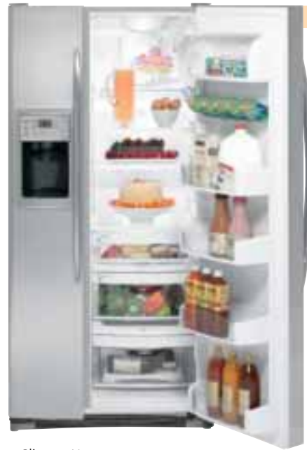
PSS23MSW GE Profile 23.1 cu. ft. refrigerator