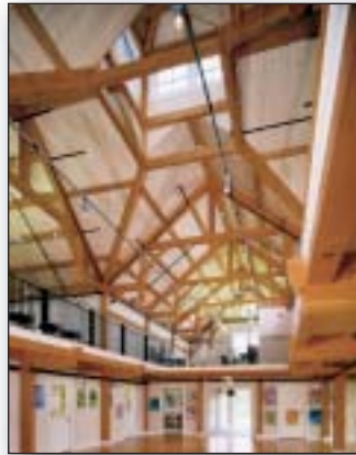
PROJECT: NANTUCKET NEW SCHOOL ARCHITECT: WILLIAM MCGUIRE, AIA