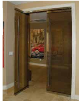
Low Profile Door Rails

Only 2-5/16" tall for 1/2" (12 mm) tempered glass. Adjust and align doors without removal. Available in six finishes.