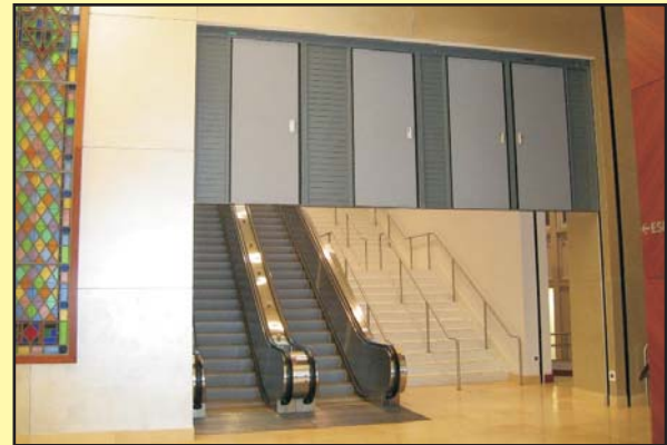
When activated, the fail-safe system lowers the coiling curtain and swinging emergency egress doors down into position....