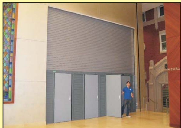
...creating the fire & smoke protection necessary for the opening while still allowing for Emergency Egress.