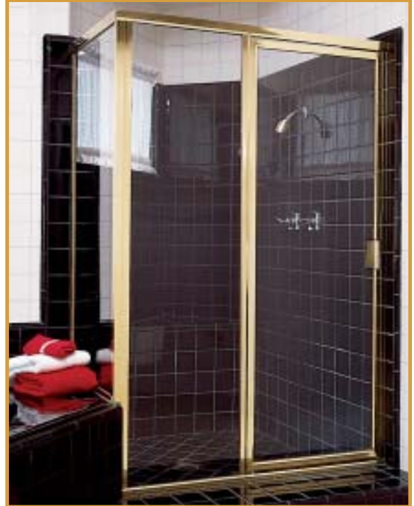
▲ Our 5100 SERIES framed piano hinge daylites may be engineered in Brite Dip Brass with an optional post at the corner as shown here.