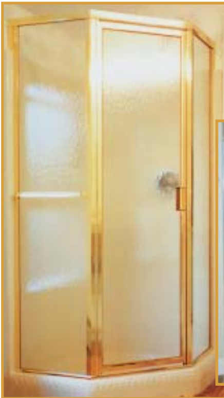
Framed pivot doors with obscure glass are an AMERICAN classic. Our 2100 SERIES neo-angle is shown with a panel towel bar.