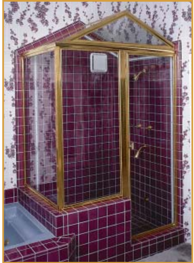
▲ Piano hinge 100 SERIES, fully framed panels and roof