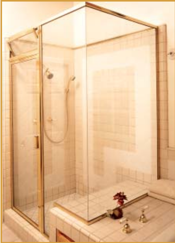
Framed door with frameless panels ▲ - piano hinge 5100 SERIES Brite Dip Brass with transom

Panels may be “framed,” as we use in our traditional “100 Series,” for a maximum exposure of extruded metal in your choice of finish. The more contemporary frameless panel systems have the profile of less metal, offering mitred glass corners and a single wall extrusion.