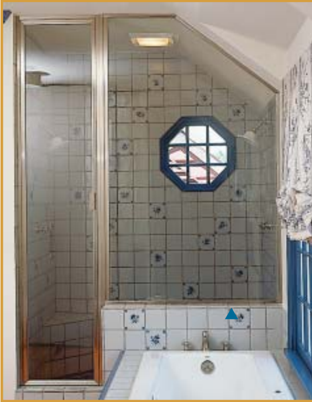
A classic 5100 SERIES can fit anywhere - ▲ and be steam - when it is custom made by AMERICAN SHOWER DOOR.