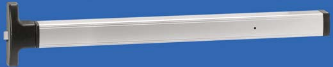
Dor-O-Matic® 1790 Series Rim Exit Device