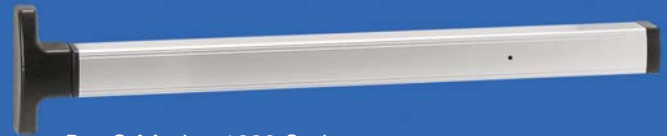
Dor-O-Matic® 1690 Series Concealed Vertical Rod Exit Device