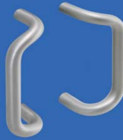
YKK AP Smart Series Pulls

The new and modern Touch Bar exit devices from Dor-O-Matic® are ideally suited for all applications that require emergency egress. The devices are ANSI Grade 1, carry the UL label and are approved for Life Safety. Both the rim and concealed vertical rod devices feature single point dogging and are available with electric actuation.