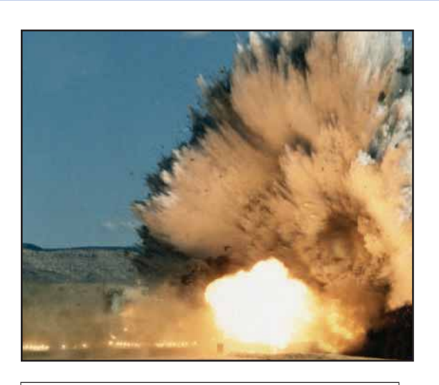
BLAST AND PRESSURE RESISTANT DOORS AND FRAMES

For protection of personnel and private property and as required by the Department of Homeland Security, DOD/ATFP requirements, GSA Level C and D, and petro chemical industry standards, Security Metal Products offers a full line of blast and pressure resistant metal doors and frames. Blast and pressure resistant doors and frames are available to resist up to a designed 4 PSI force.