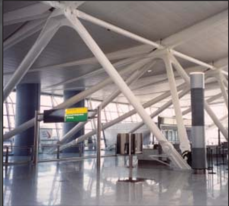
JFK International Arrivals, New York, NY

Architect: Skidmore Owings & Merrill