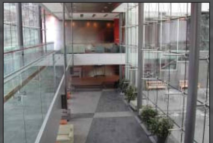
Harvard Medical School, New Research Building, Boston, MA Architect: Architectural Resources Cambridge