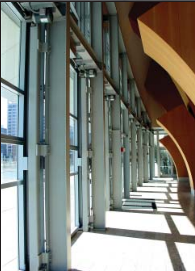
Walt Disney Concert Hall, Los Angeles, CA Architect: Frank Gehry