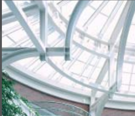
A/D FIREFILM on structural steel