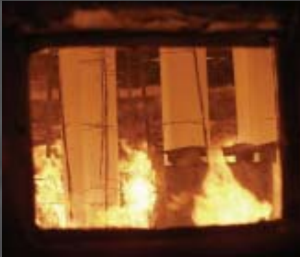
Columns exposed to a standard ASTM E119 (UL263) fire exposure

Building codes require certain beam, column, floor, wall and roof assemblies to have fire resistance ratings which are determined on the basis of standard fire tests. Fire resistance ratings can be accomplished with the application of sprayed fire resistive materials (fireproofing) to those assemblies.