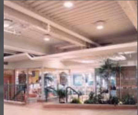
Southwest Fireproofing Type 5GP on steel beams & decking