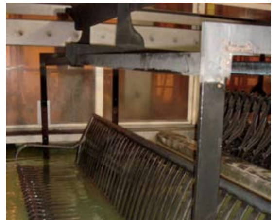
Zinc Phosphate Bath