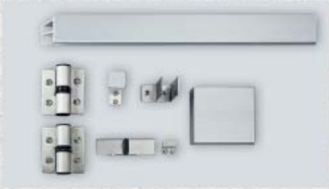
STANDARD CONCEALED STAINLESS STEEL HARDWARE Series: 1090 (3 Hinges, 2 Door Stops), 1080/1180 (3 Hinges), 1040, 1030