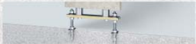
STANDARD FLOOR-ANCHORED STILE BASE Series: 1540