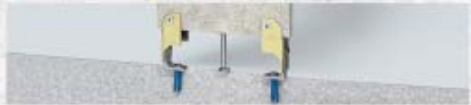
STANDARD OVERHEAD-BRACED STILE BASE, LEVELING DEVICE Series: 1540