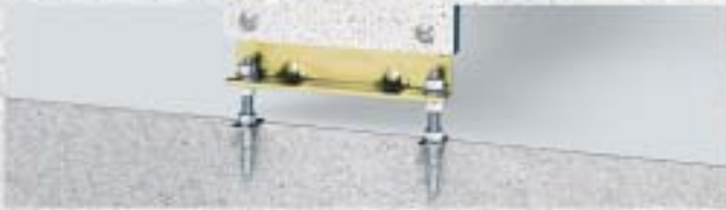
STILE BASE LEVELING DEVICE Series: 1090, 1080/1180