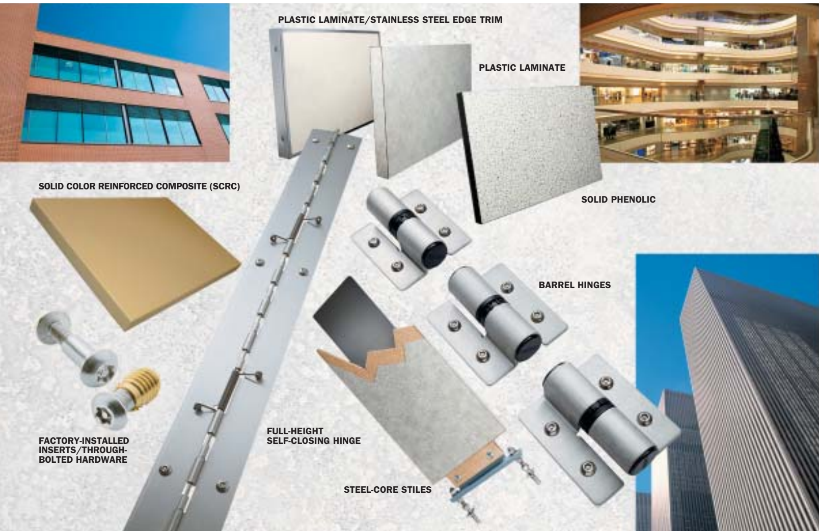
PLASTIC LAMINATE/STAINLESS STEEL EDGE TRIM