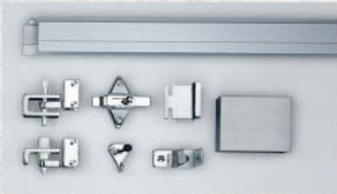
STANDARD THROUGH-BOLTED ZAMAK HARDWARE Series: 1540; Stainless Steel Option