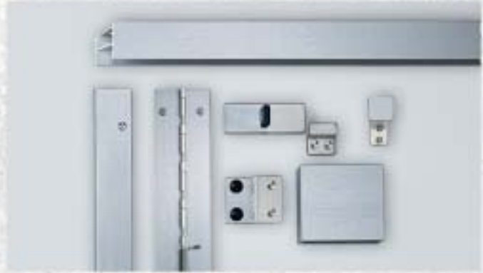
OPTIONAL FULL-HEIGHT STAINLESS STEEL HARDWARE Series: 1090, 1080/1180, 1040, 1030