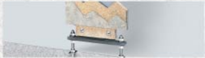
STANDARD STEEL-CORE STILE WITH WELDED LEVELING DEVICE Series: 1040, 1030; 1540 Option