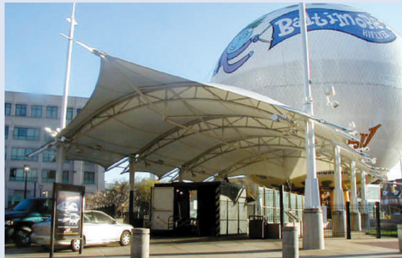
Shot Tower/Marketplace Metro Station Entrance; Baltimore, MD