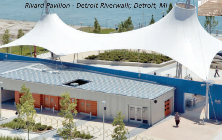
Rivard Pavilion - Detroit Riverwalk; Detroit, MI