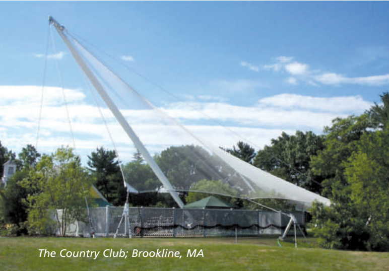
The Country Club; Brookline, MA

Design Development and Design/Build. Your partner for project excellence!