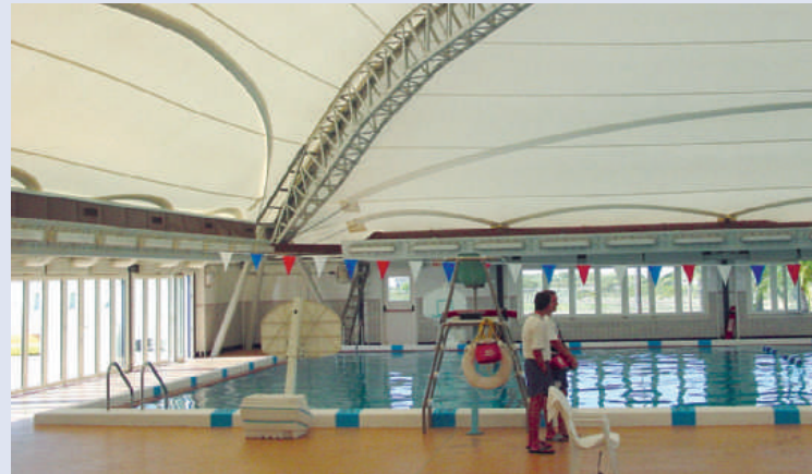
Pool Enclosure; Rota, Spain