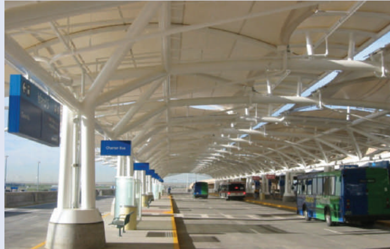
Terminal Canopy; Denver Int'l Airport

Teflon and Tedlar are registered trademarks of Dupont.