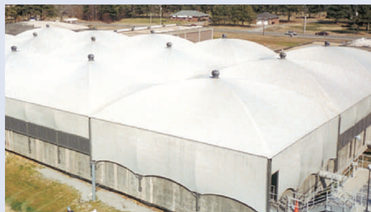
Water Treatment Facility; Chesapeake, VA

Wall openings can be of virtually any width and wall systems can be designed to be opened or removed allowing natural climate control. Sunshade/canopy structures without walls are also available.