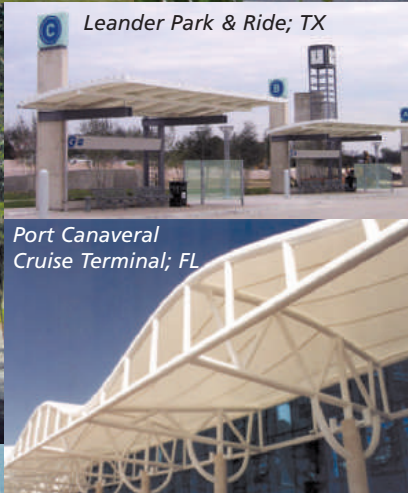
Leander Park & Ride; TX