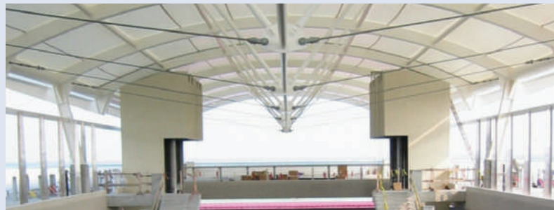
Lightwell; Raleigh-Durham International Airport