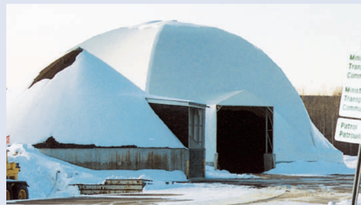
Sand/Salt Storage; Ontario, Canada