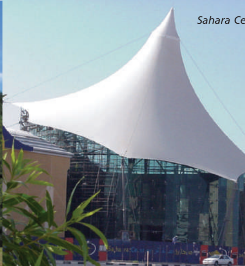
Sahara Centre; UAE