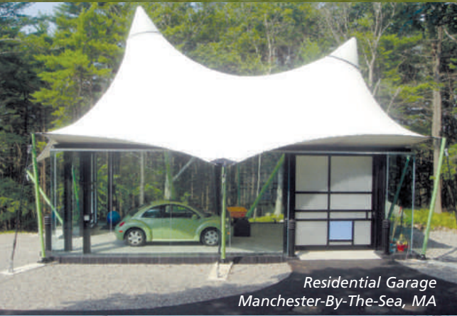
Residential Garage Manchester-By-The-Sea, MA