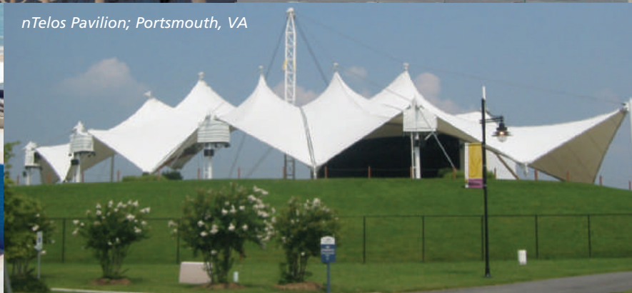
nTelos Pavilion; Portsmouth, VA

This is descriptive literature and does not constitute warranties, expressed or implied. For statement of warranty, contact Span Systems, Inc.