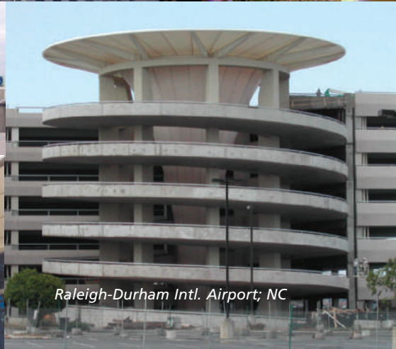
Raleigh-Durham Intl. Airport; NC