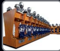
CUSTOMIZABLE WOOD LOCKERS