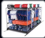
GEARBOSS II HIGH-DENSITY STORAGE