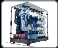
GEARBOSS HIGH-DENSITY STORAGE