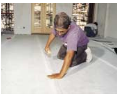
Note: See installation bulletin for complete details.